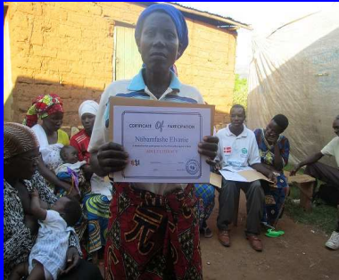
One of our happy laureates on the Matching Day Ceremonies in Kabezi, 29th May 2014.

To acquire a permanent Adult Learning Center in Burundi so that the adult illiterate (in priority the women) can access education