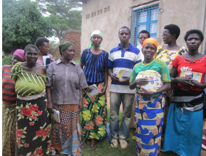
Some of the beneficiaries of our Adult Learning Programme in Kabezi: Jan to May 2014

ASODEC: Association pour la Solidarité et le Développement Communautaire (Solidarity and Community Development Association)